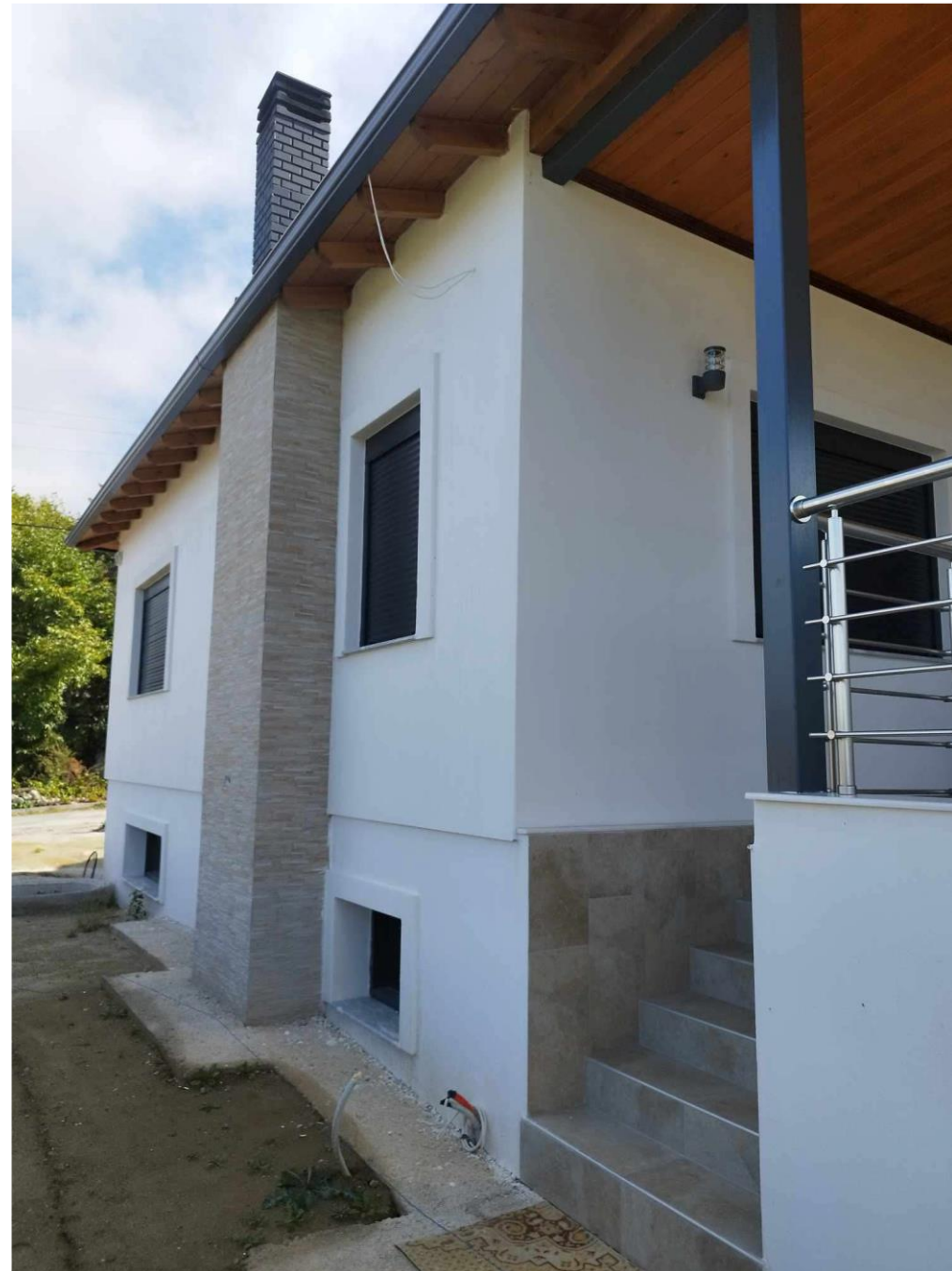
House with a plastered surface